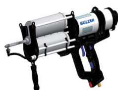
Metering, Mixing, Dispensing for 2-K Materials

We offer 2-K cartridges in various sizes.