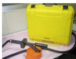
IH coating peeling machine “MEKURERU”

The interlayer peeling technology by induction heating.