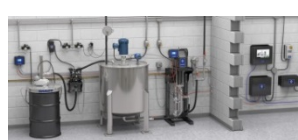
Intelligent Paint Kitchen

IoT management in paint circulation room. Gaining efficient paint circulating and system driving.