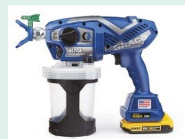
Ultra MAX Cordless

It is cordless so you can spray easily anywhere.