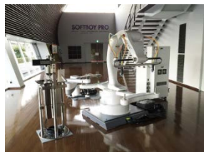
Coating Robot “SWAN”

※As of Oct. 18, 2018. In random order. Exhibitors and products may differ from the actual ones at the show.